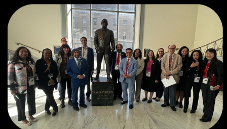
Brain Mapping Day