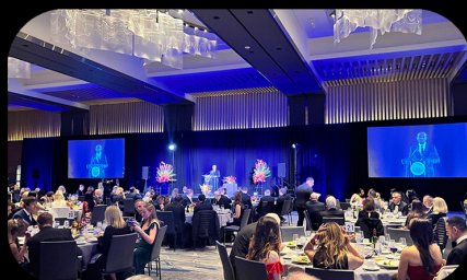
GFC Awards Gala