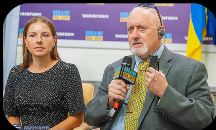
Global Physicians and Scientists

We are proud of our youngest members, therefore we listen to them as we do with our seasoned veterans.