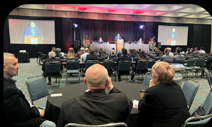
Annual World Congress