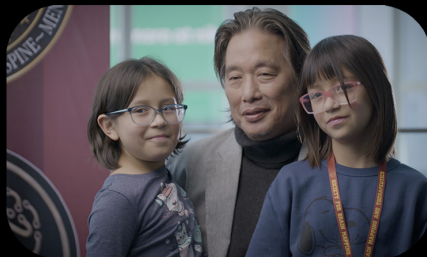
SBMT Kids Corner