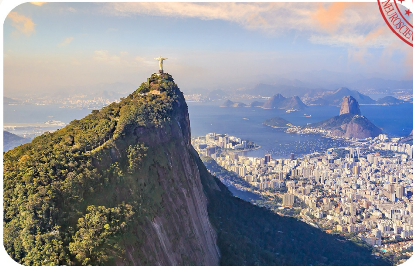
Rio de Janeiro, Brasil